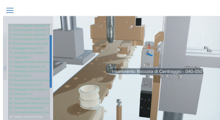
Inserimento Boccola di Centraggio